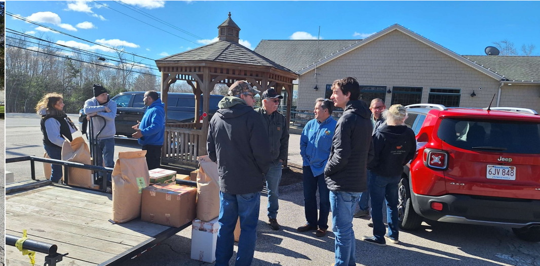
For the Fertilizer and Supply pickup, here are just a few of the growers at the SNGPG Seminar